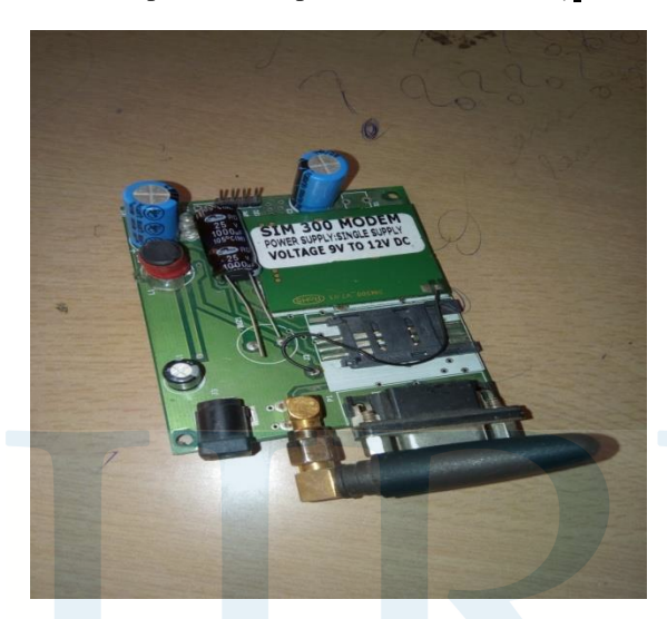
Figure3: GPS Module