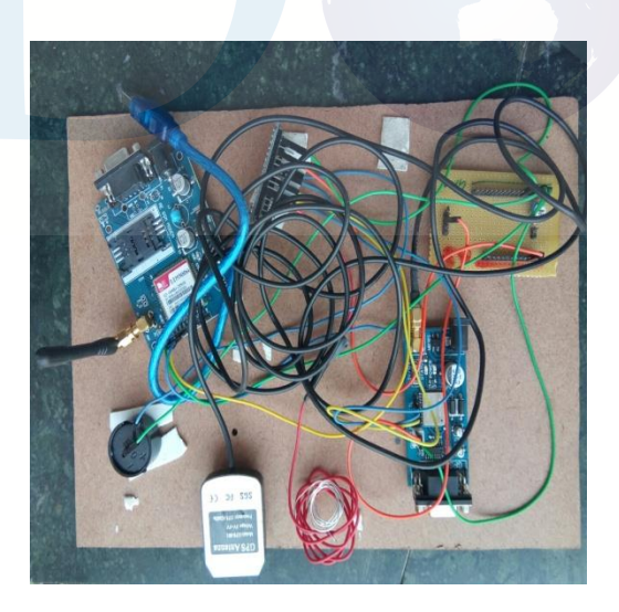
Figure 4: GPS Module with GSM