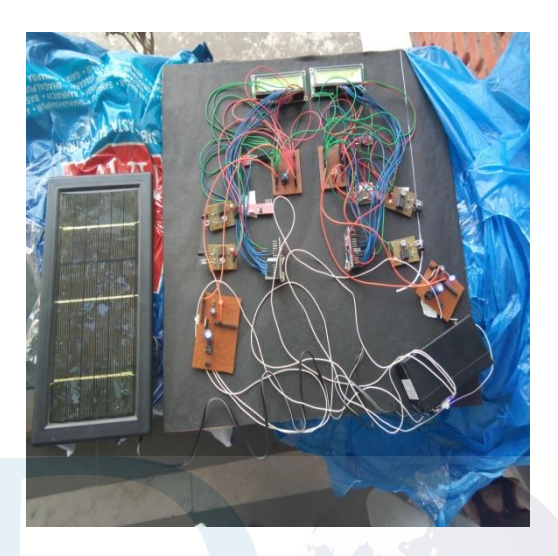
Figure 4: Circuit of Project