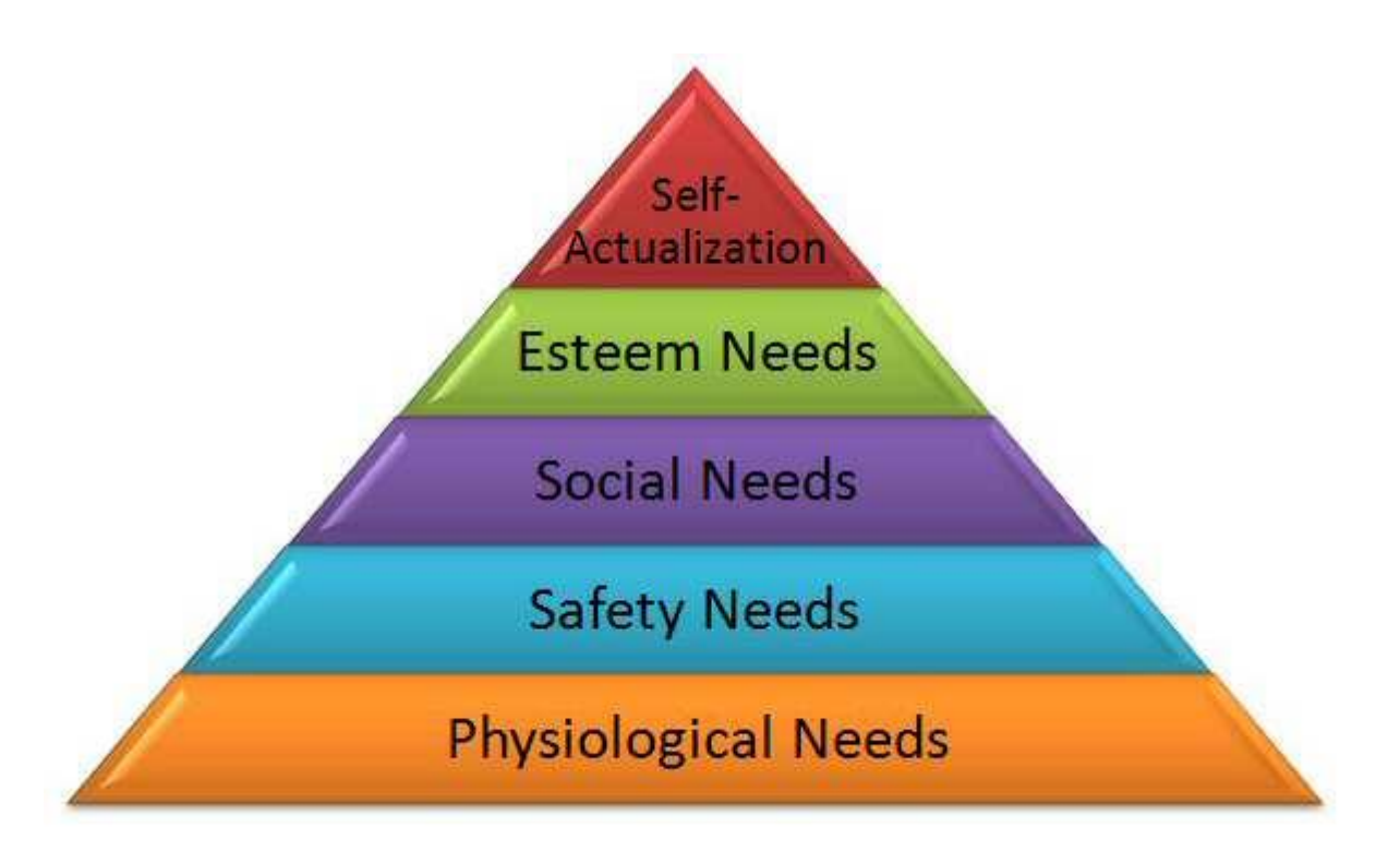
Figure 1: Maslow's hierarchy of needs

This study utilized Maslow's theory as lenses to interrogate the intersection between various factors and absenteeism. The humanistic approach is of the view that human beings posses an innate tendency to improve and to determine their lives through decisions they make (Lahey, 2009:425). Maslow proposed a hierarchy of needs model featuring five levels to provide a better way to better understand how individual needs are met (Maslow, 1943). The five levels of motivational needs are physiological needs, safety needs, love and belonging needs, self-esteem needs and self-actualisation as highlighted in the diagram below.