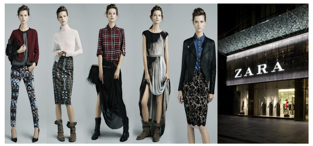
Figure 1 a sample of ZARA casual wear