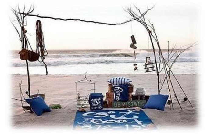
Figure 5 a beach holiday