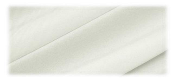
Figure 13 Milky white silk (silk) cloth

Properties and characteristics of the fabric: soft, elastic, collage, and semitransparent.