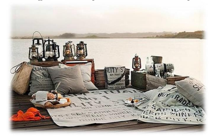
Figure 6 appreciating the beauty of lakeside scenery