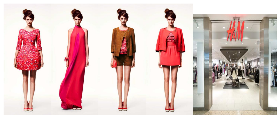
Figure 2 a sample of H&M casual wear