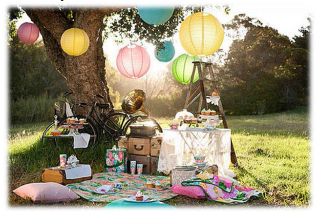
Figure 4 a picnic under a tree

A picnic under a tree in a leisure afternoon with warm sunlight, gentle breeze, birds' twitter, and the fragrance of flowers by the side.