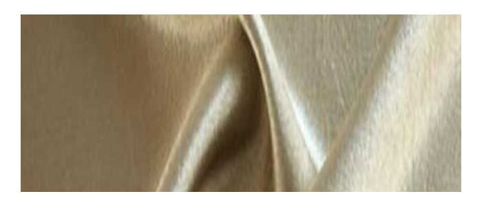
Figure 12 Gold and silver composite fabric

Properties and characteristics of the fabric: soft and elastic.