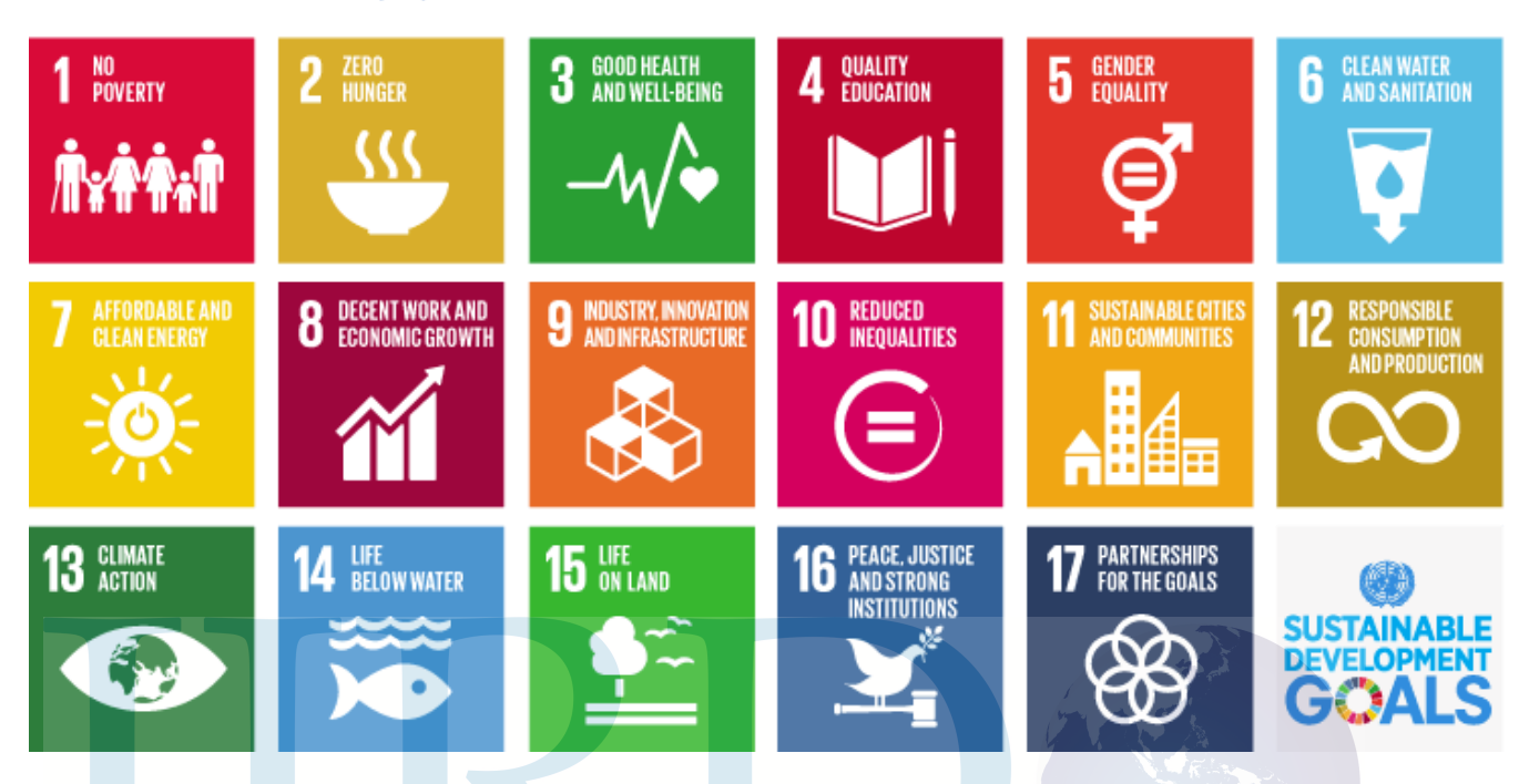
Figure 2. Infogram for Sustainable Development Goals. 2016; Bendell, 2016; Thomson, 2015)

Achieving these SDGs is about getting from words to actions: implementation. It is about applying what has been learned implementing the MDG. The core values remain equality, respect for nature and so forth. The SDG are an umbrella of overarching flexible targets tailored to regional, national and sub-national levels. Although target-driven, the SDG project must not overlook the need for transformative changes. The targets must be formulated precisely and measured continuously (United Nations [UN], 2012).