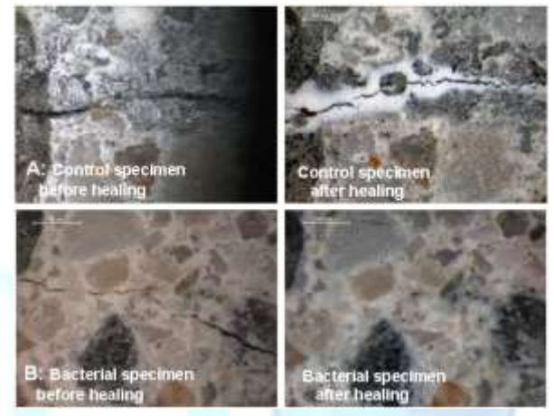
Fig. 1 self-healing admixtures composed of clay pellets.

As the oxygen is consumed by bacteria in these process it prevents the corrosion of the embedded reinforcement. As the oxygen plays the vital role in the process of corrosion and thus the durability of the steel increases. It is taken care that both the components bacterial spores and the calcium lactate are introduced into the concrete within separate expanded clay pellets 2-4 mm wide. So that they do not get activate during the cement mixing process. They do activate only when the cracks open up the pellets and the incoming water comes in contact with calcium lactate and bacteria