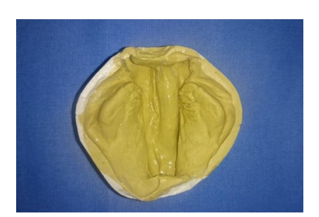
Figure.3 Cast poured with dental stone