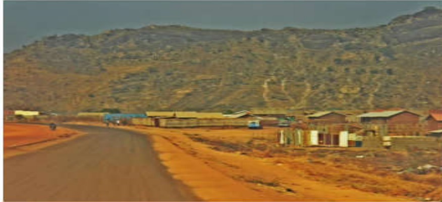
Figure 5: show Jebel Kujur Mountains in South Sudan