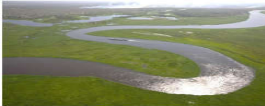
Figure 8: Show White Nile in South Sudan

Moruland pouring its water into the Sudd; and Atepi River originates from Kinyeti hills near Lobone in Eastern Equatoria and flows through Palwar, Pajok and Owinykibul before joining Aswa River at Aswa village, about 600m east of Aswa bridge on Juba Nimule Highway. Nevertheless, it is also involve Unyama River which originates from Northern Uganda and enters into South Sudan through the Nimule border in Eastern Equatoria state and joins the River Nile at Western part of Nimule. The country also have Seasonal Rivers such as Luri River and this river originates from Lainya hills in central Equatoria state and flows Northeastwards before joining the Nile River. Ibba River originates from Democratic Republic of Congo (DRC) boarder and flows Northwards into East of Yambio town, towards Tonj and enters Jue/Sue in western Bahr el Ghazal in South Sudan also involve Ayii River which originates from Lotii Mountain Ranges (Greenland Lotii) in Obbo, Eastern Equatoria state and flows through Obbo, Magwi, Panyikwara and Owing kibil before joining the Nile River. Hereafter, other river is Kimoru River that originates from Imurok hills near Torit, Eastern Equatoria state and flows through Magwi where it joins Ayii River. Singata River originates from Didinga hills in Eastern Equatoria and flows through Kapoeta into the Western plain.