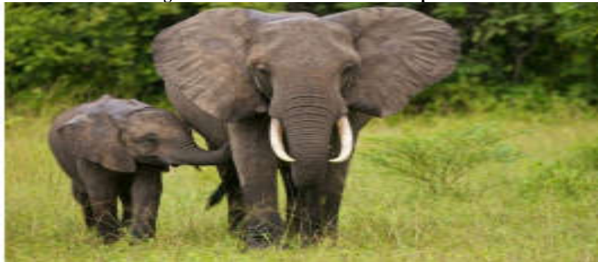
Figure 9.3.1. Show Nimule National park

The Nimule Park is one of the national parks in South Sudan that has African elephants herding. This promote the country to be one of the beautiful tourist destination with vast diversity of wildlife and attractive landscapes, diverse culture, historical sites and variable climate. It has wonderful wetlands which are inhabited all year round with thousands of bird's species including some migratory birds and animals.