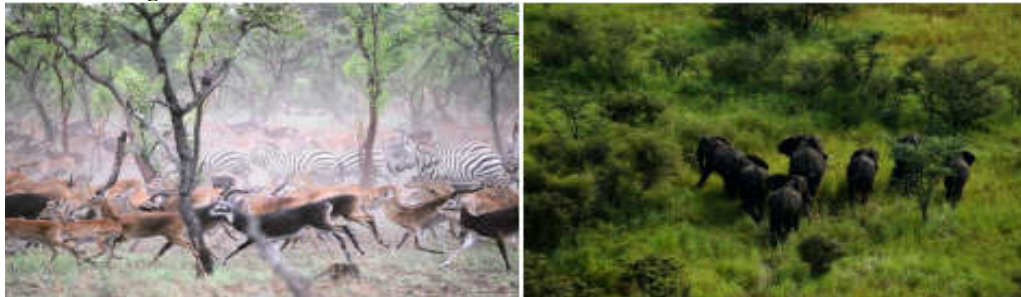
Figure 9.3.2: show some of the wild animals found in Boma National Park

Boma National park is the park located in eastern part of the country in Boma County, Pibor Administrative Area. It is the natural park which content various types of wildlife such as elephants and antelopes as well as