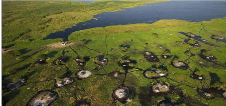
Figure 5.3.3.1: Show the Sudd Wetland in South Sudan

The Sudd wetland, with an estimated area of approximately 57,000 km 2 represents one of the largest freshwater ecosystems in the world. The extent of the Sudd wetlands is highly variable; it depends largely on the seasons and years respectively. In the wet season, the size of the wetland increases up to 90,000 km 2 and gradually decreases to about 42,000 km 2 , depending on high seasonal flood. It is sustained by the flow of the White Nile or Bahr el Jebel which coming from Lake Victoria in Uganda, and by rainfall runoff from its surrounding areas.