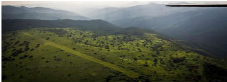
Figure 6: show Didinga Hills in Torit district, Eastern Equatoria State

It also consist of Lopit hills which located in Torit district in Eastern Equatoria state. The area around the hills is rich and fertile suited for cultivation of sorghum, bulrush, millet, pumpkin; groundnuts, simsim, and okra.