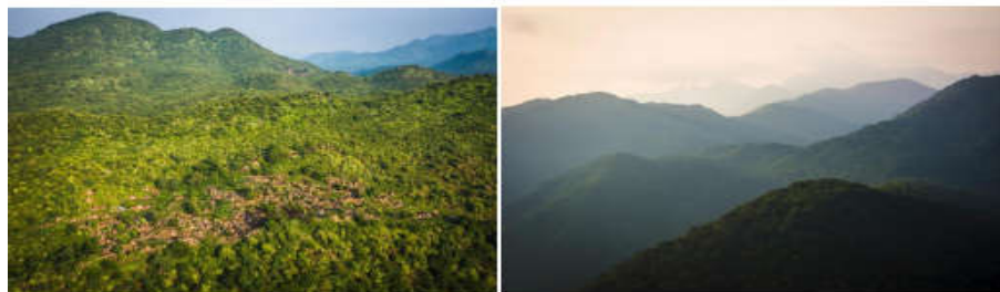
Figure 7: The Lopit hills in Torit, Eastern Equatoria state

It also consist of Lopit hills which located in Torit district in Eastern Equatoria state. The area around the hills is rich and fertile suited for cultivation of sorghum, bulrush, millet, pumpkin; groundnuts, simsim, and okra.