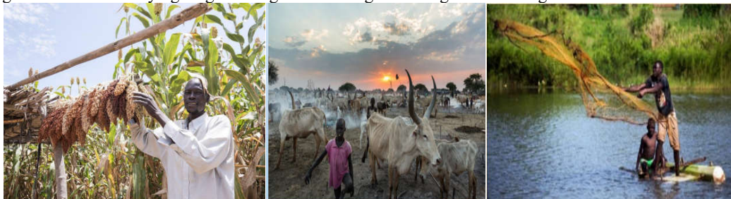
Figure 4: showiing fisherman in White Nile

Figure 1: show man drying sorghum. Figure 2: rearing cattle. Figure 3: Fishing method