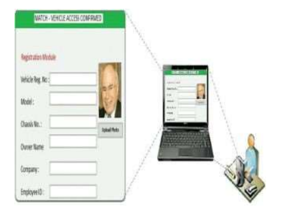
Fig1.6 REGISTRATION AND ALERT APPLICATION