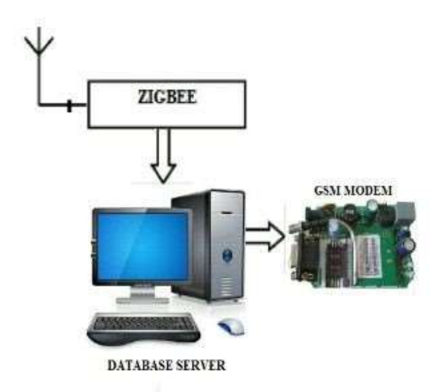
Fig 1.4 RECEIVER SECTION