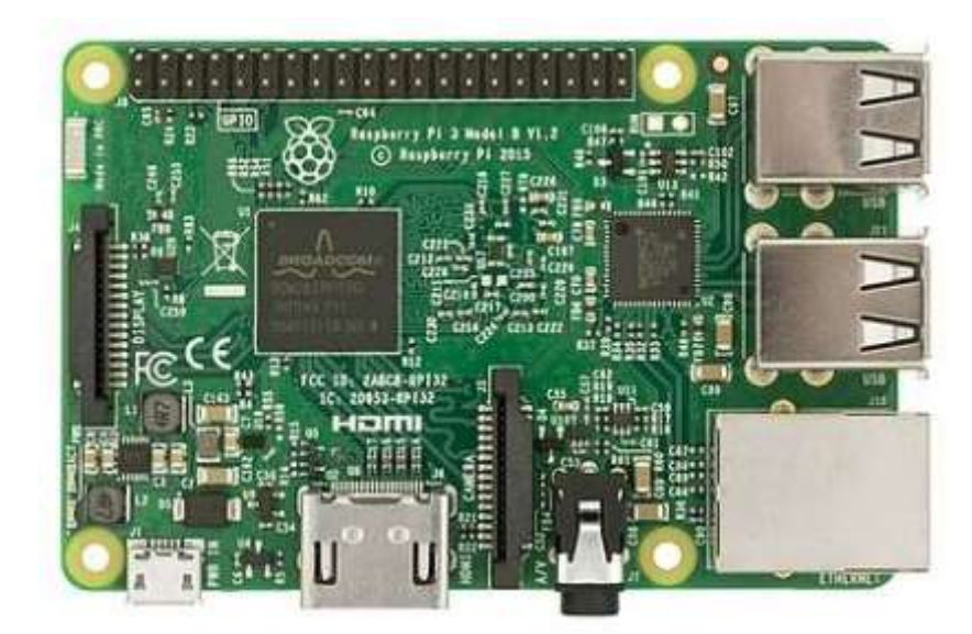
Figure- Raspberry Pi 3 Model B

Using the above two distinguish elements we will require some sorts of IR sensor, Alarm, Temperature sensor, level sensor, LCD display, Motor speed sensor, etc. for complete environment.