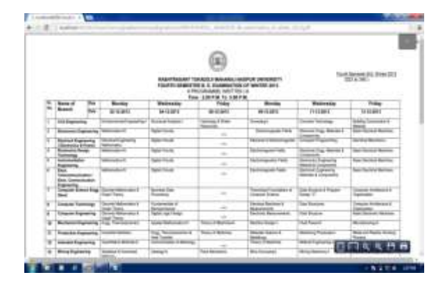
Figure 9: Snapshot of PDF Viewer

The above shown are the snapshots of the homepage and the various file formats provided in the homepage showing the audio player, video player, pdf viewer, etc.