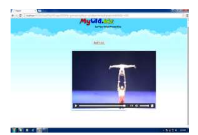
Figure 8: Snapshot of Video Player