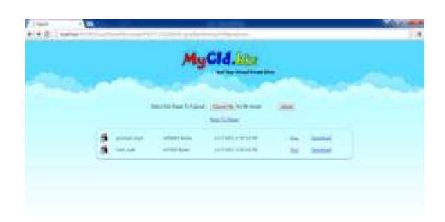
Figure 7: Snapshot of Video Play List