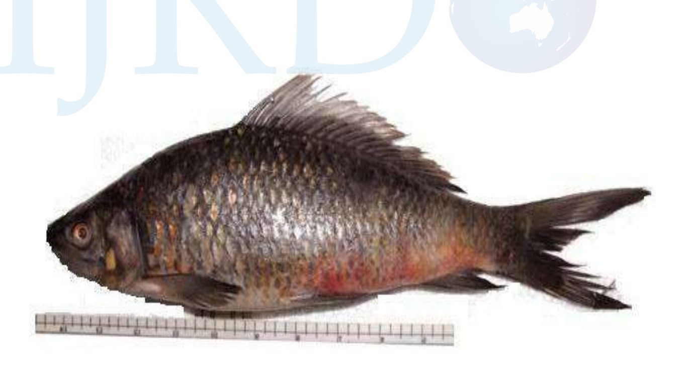
Fig 2: Labeo nandina (Ham.)