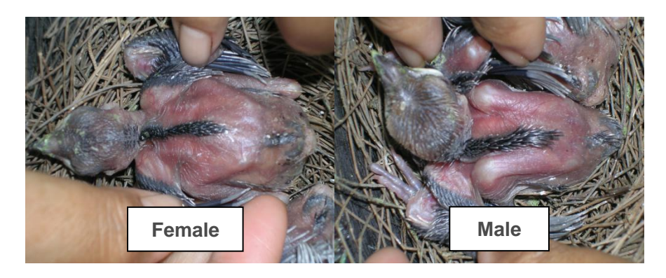
Figure 2. Anatomical defference of supit/pubis in male and femal Jalak Bali.