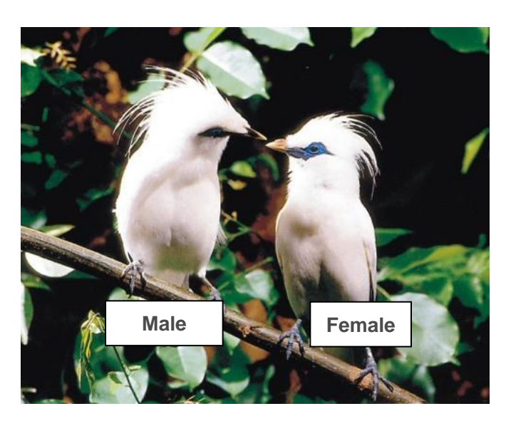
Figure 1. Male and Female Jalak Bali Morphology

Jalak Bali have a bluish-green oval eggs with an average of the longest diameter is 3 cm and smallest 2 cm.