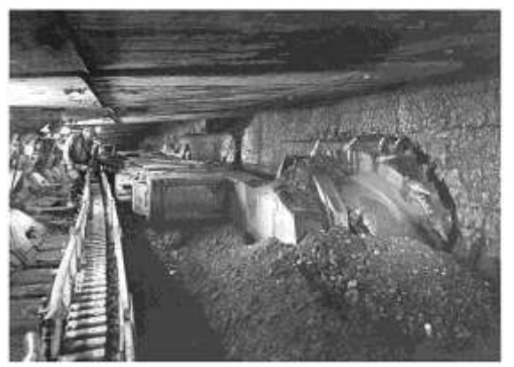
Figure 1. Long wall

The production and productivity of individual, continuous, and long wall production units have increased consistently over the years.