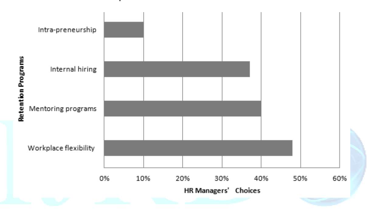
Figure 2. Retention Programs for Millennials Used by HR Managers in the North America (%) (Millennial Branding, 2013).

Figure 2 indicates what programs are implemented by human resource managers not only in Canada but also in the United States in order to address the Millennials' needs at the workplace.