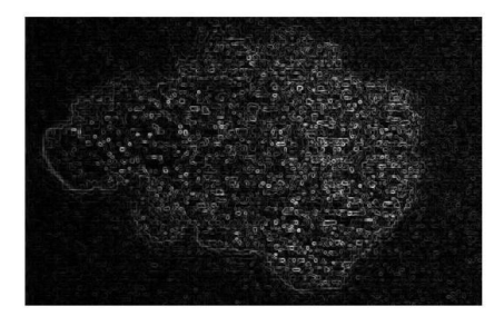
Figure 2.2 Pre-processed image 3.2. Segmentation

With this the image becomes easier to analyze and the visual quality is improved. The pre-processed image is then subjected to segmentation. The sample image of skin lesion before and after Preprocessing is shown below.