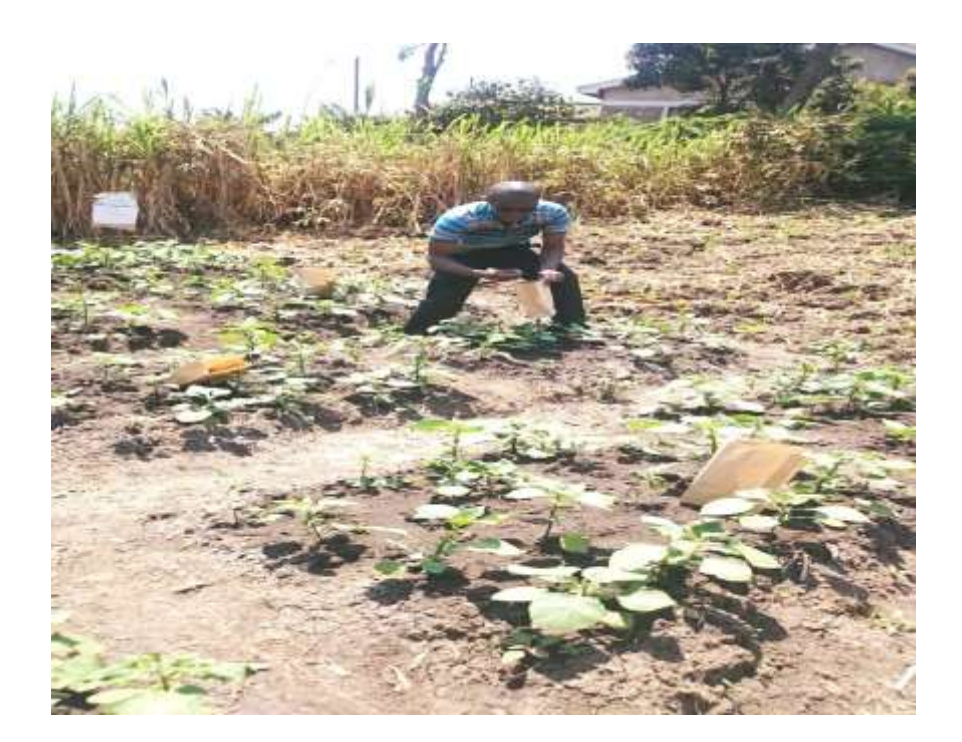
Figure 1: Collection of Crop Samples